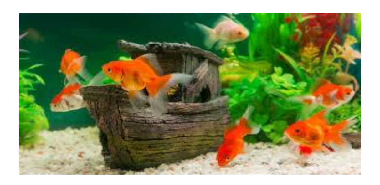
Do you have a fish tank that you no longer need (with or without fish)

We are slowly making changes to our beautiful room and it is looking good. Our quiet corner is welcoming and calming, and we would like to add the tranquility of fish. We do not need a huge tank just a reasonable size tank which can be placed safely on the shelf which is safe and in working order. If you do, please let us know – we would be grateful for the donation.