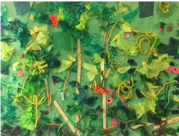
Triscombe Class's rainforest